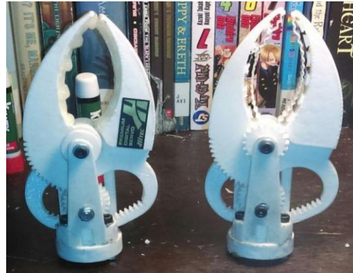
Fig. 2. 3D printed grabbers

The design of the grabber was perhaps one the more challenging problems the team faced while designing the robot. Many different prototypes were considered, however when it came to the actual nuts and bolts of the grabber and how it would function, the team struggled to find a workable, reliable and easy-to-use solution. Ultimately the team decided a 3D printed grabber would allow for much faster prototyping and modifications. The basic claw design was found on www.thingiverse.com/thing:1480408 with the name Mantis Gripper. The claw wasn't originally intended to be used underwater, but as the team planned to 3D print it and use waterproof servos, there was no reason why it could not be used underwater. After downloading the claw's STL file from the website, it was modified using SolidWorks 2015 3D modeling software and made suitable for our needs. The modified claws were then 3D printed using PLA plastic on a MakerBot Replicator 2 (see fig. 2). The most efficient and effective way of mounting and securing the washers and bolts needed for the grabbers turned out to be gluing the washers and bolts down. Silicone was applied to the inside of the claw's pinchers to give the drone the grip that was necessary underwater. With that done, the claw was essentially finished, and a second claw was constructed with the same procedure as the first.