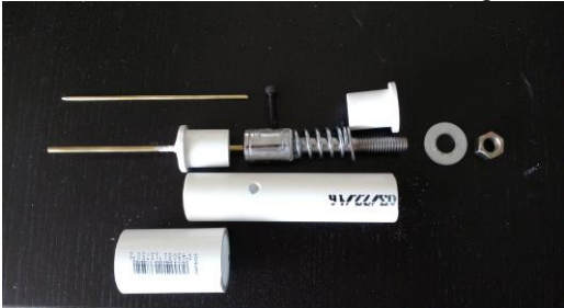
Fig. 4. Torpedo launcher

The initial idea of this torpedo design came from a desire to mimic an actual torpedo, one that has real propulsion and thrust. A dart that just shoots out of a barrel was not satisfying enough. Some ideas that were proposed included battery powered propellers or compressed air. The team considered the compressed air route would be much easier to make and cheaper since CO<sub>2</sub> cartridges are easily available. The torpedo itself is made from a 3/4" PVC pipe, a 12 gram CO<sub>2</sub> cartridge, commonly used for airsoft guns, three fins and a torpedo head was designed using SolidWorks and 3D printed using the MakerBot Replicator 2 with PLA material (see fig. 5). The torpedo is loaded into a launcher that will puncture the CO<sub>2</sub> canister within the chamber to give the torpedo its initial thrust. The launcher is comprised of a PVC coupler to hold the torpedo, another 3/4" PVC pipe on the other end of the coupler that houses a spring-loaded mechanism that will strike a firing pin to puncture the CO<sub>2</sub> canister. Two modified PVC end-plugs were used to encase the spring and also hold the firing pin made from a brass tube and rod (see fig. 4).