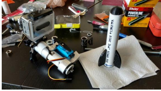
Fig. 5. PVC torpedo and 3D printed head and fins

Within the launcher is a zinc-plated steel hex bolt with a 9/16" socket affixed to the head. The bolt goes through a 45-lb. spring and PVC end-plug. The socket was used as a guided hammer to strike the firing pin as the diameter was close to the inside diameter of the PVC pipe, making a smooth and straight slide through the barrel. A hex screw was attached to the socket to be used as a trigger to decompress the spring. The spring is compressed by using a hex nut to tighten the bolt from the outside of the barrel.