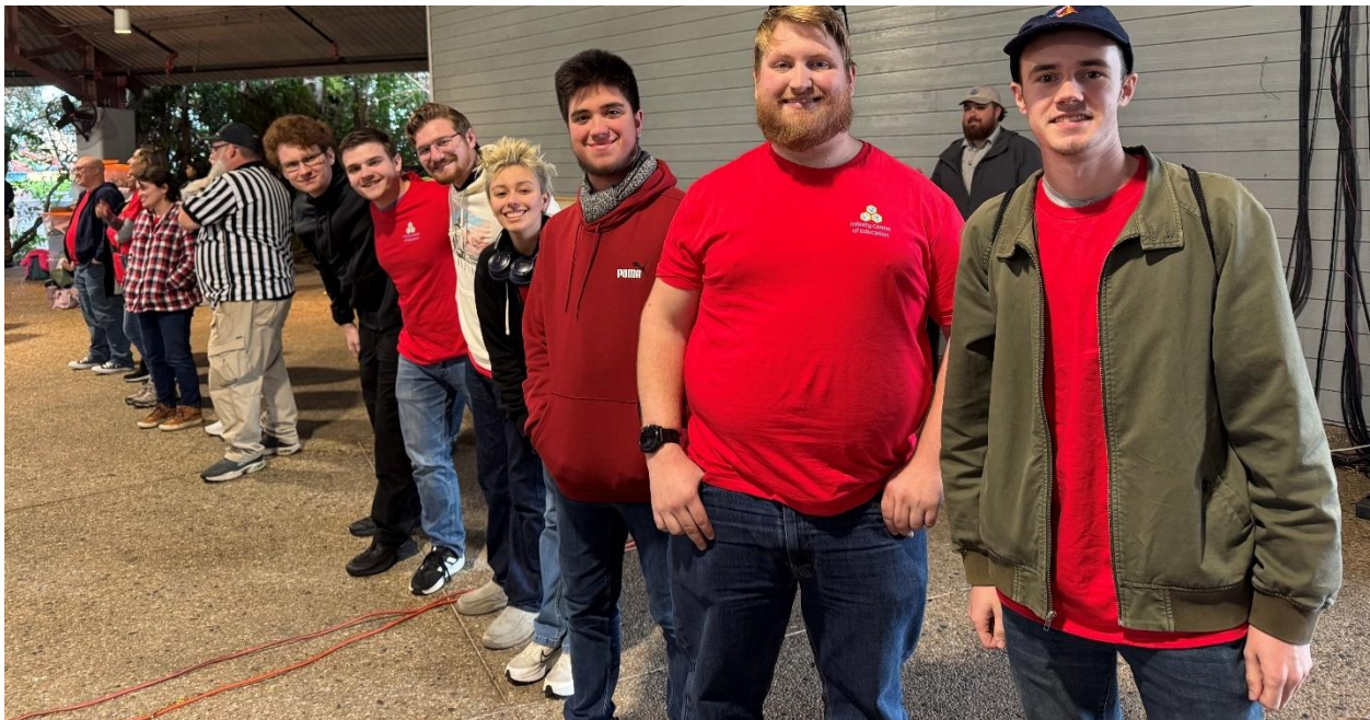
Figure 1: Photo of some of the Volunteers at the Award Ceremony, January 11, 2024