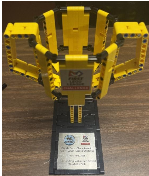
Figure 2: Award given to the President of AMRA for the great Volunteer Work AMRA provided during the Regional and State Championships. The award is for Volunteer of the Year.

After supporting the event in January, the director of the event asked us personally to volunteer again for the State Championship during the weekend of February 7-8, 2025. We accepted the invitation and were able to put together the following list of volunteers for this second outreach event which was sent to the activity director. The event volunteers had a great time, and the activity director said, “LEGO would not have been successful without AMRA supporting, representing 40% of our volunteers”