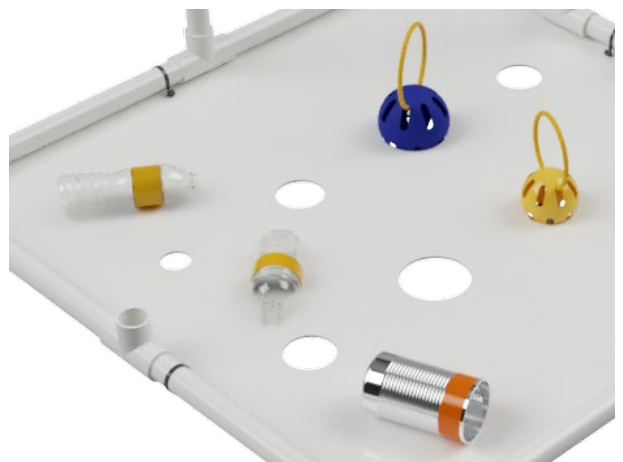
Task 4: Sunken Waste