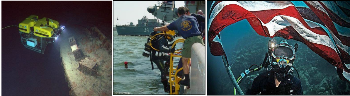
Photos a) NOAA's ROV Hercules exploring underwater, b) A Navy deep-sea diver prepares to enter the water, c) A Naval petty officer brings the American flag to his underwater salvage unit